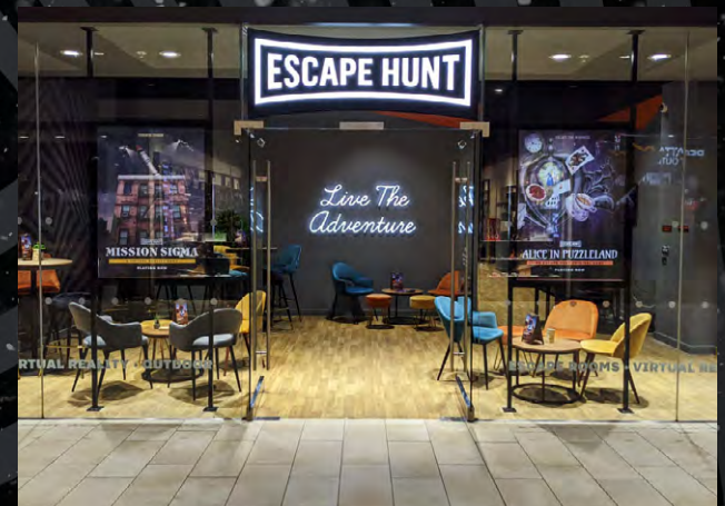
PRIVATE HIRE OPTION AVAILABLE