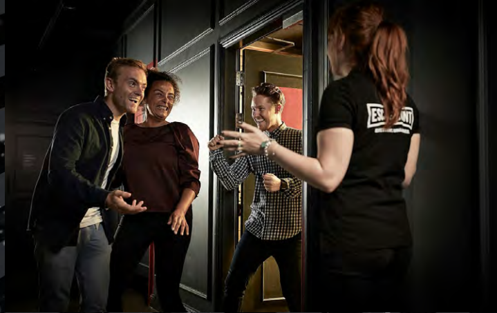
EXPERT GAMES HOST