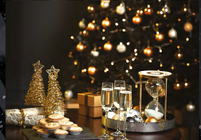
FESTIVE DECORATED VENUE