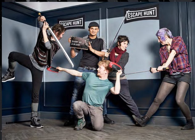
FUN PHOTO OPPORTUNITIES