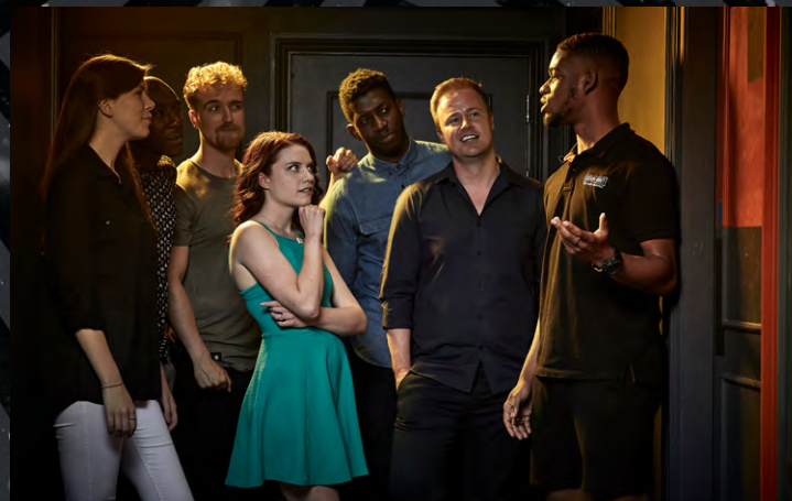
EXPERIENCED EVENT PLANNERS