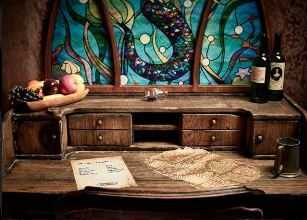
5* RATED ESCAPE ROOM THEMES