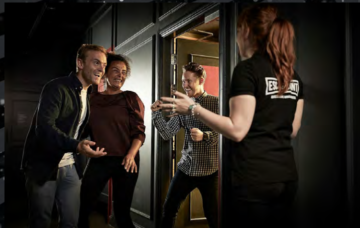
EXPERT GAMES HOST