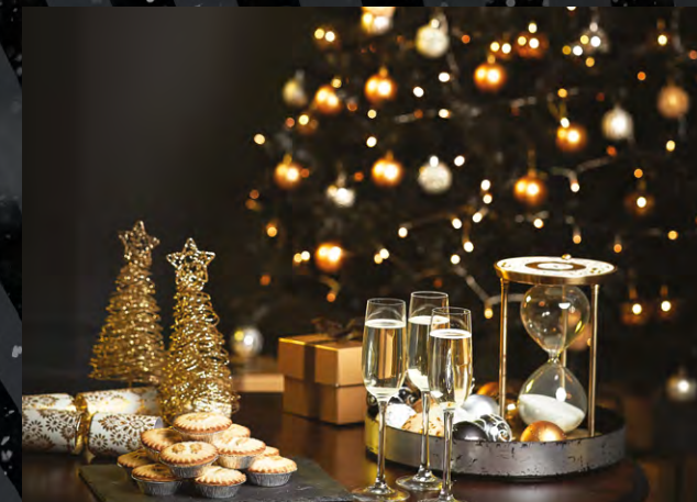
FESTIVE DECORATED VENUE