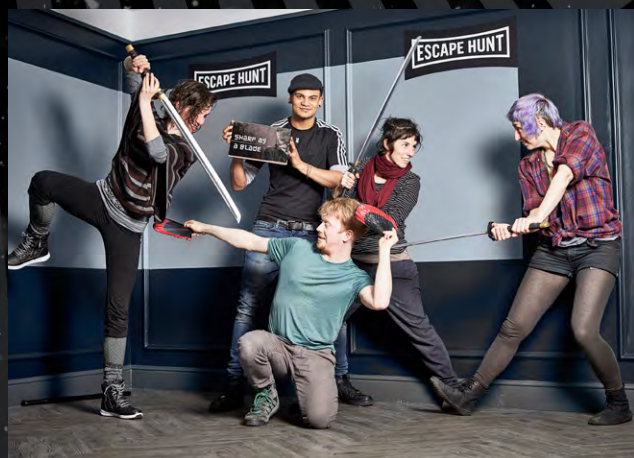
FUN PHOTO OPPORTUNITIES