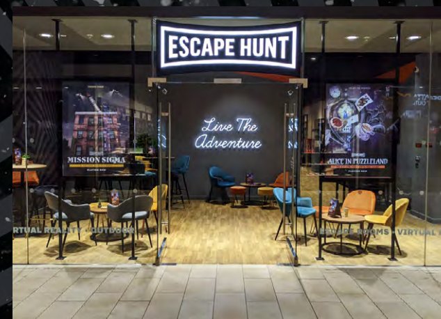
PRIVATE HIRE OPTION AVAILABLE