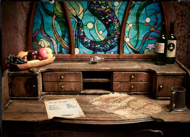
5* RATED ESCAPE ROOM THEMES