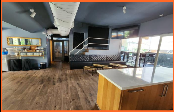
Main Bar & Large Balcony