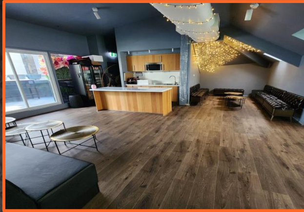
Main Bar & Party Nook