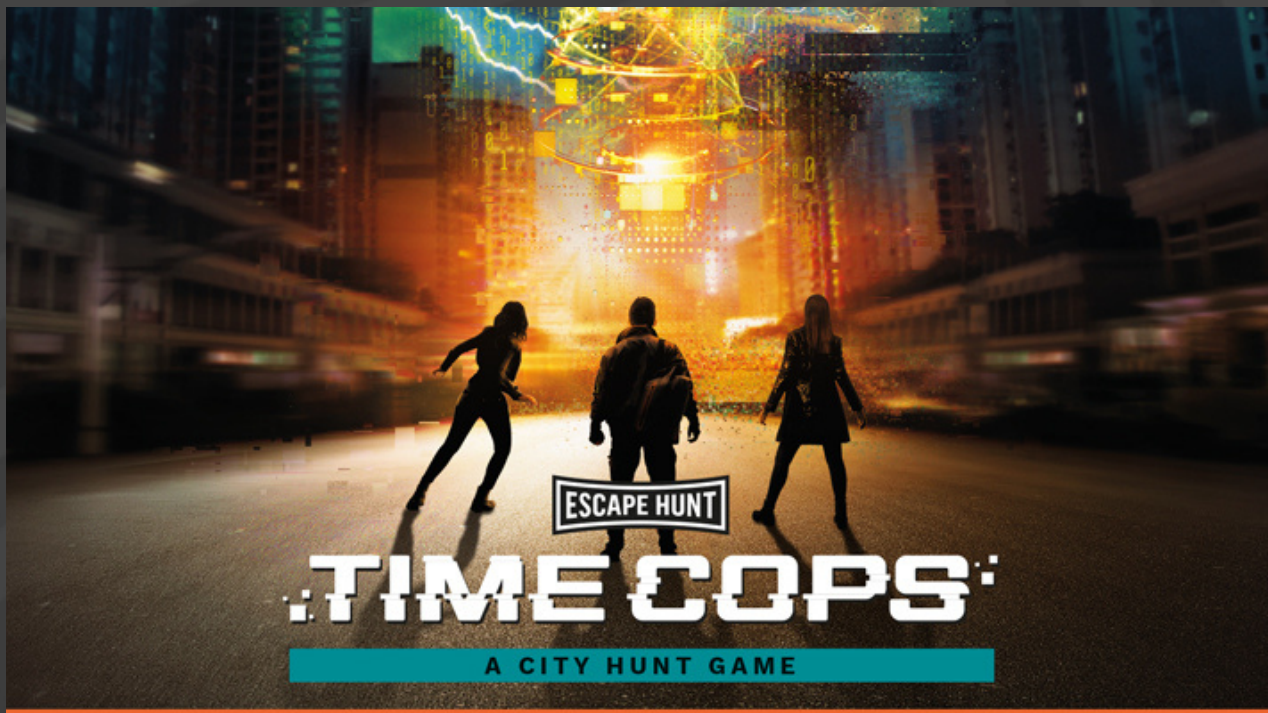
Image Description: Three individuals stand with their backs turned to the camera. They are looking at a large burst of electrical energy on a city street. Text overlay reads: 'Time Cops: A City Hunt Game'.